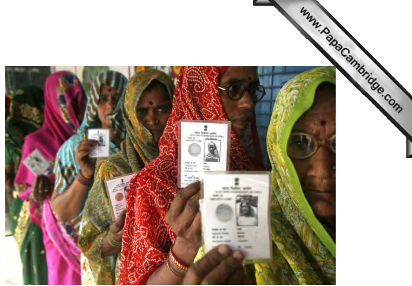
Checking voter identity