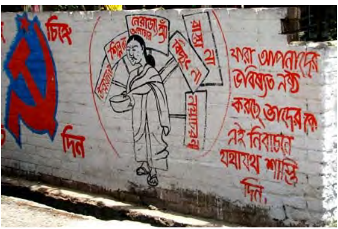
Party-political campaign graffiti in West Bengal