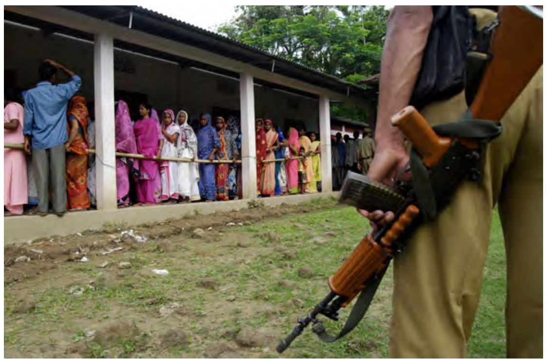
Security at a polling station in Silchar